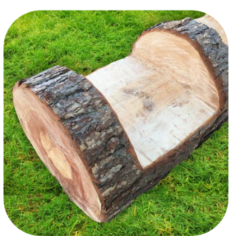
Seat Cut Outs